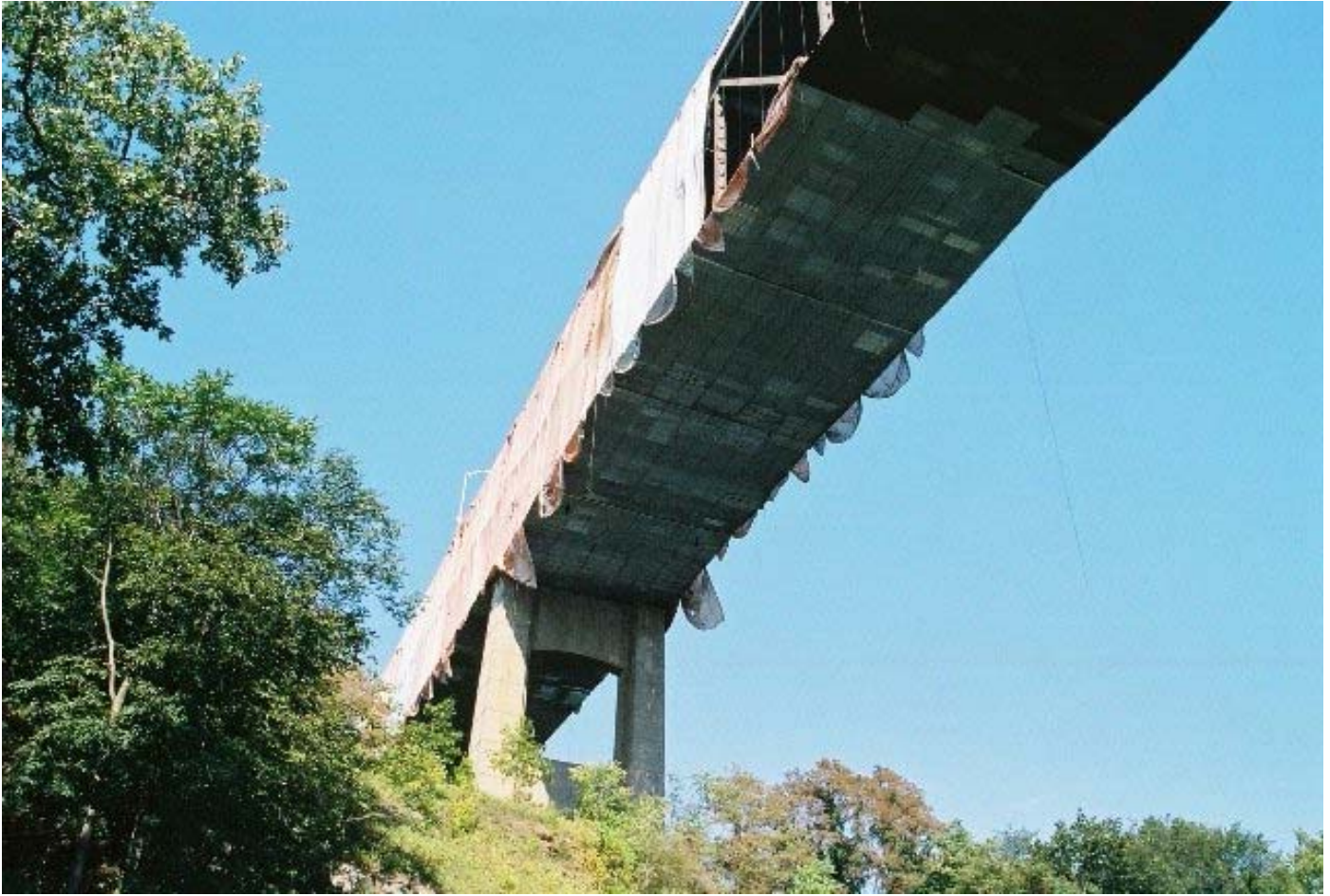
Cable Supported Metal Deck Platform System & Containment