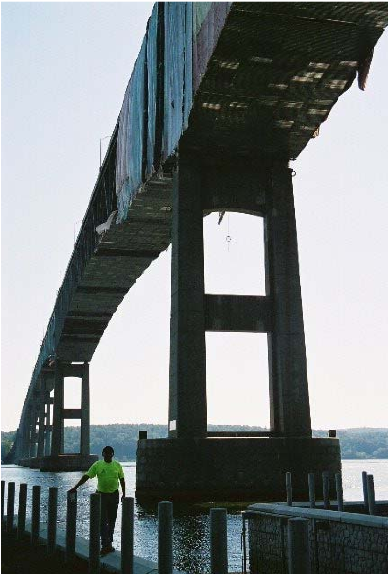
Cable Supported Metal Deck Platform System & Containment