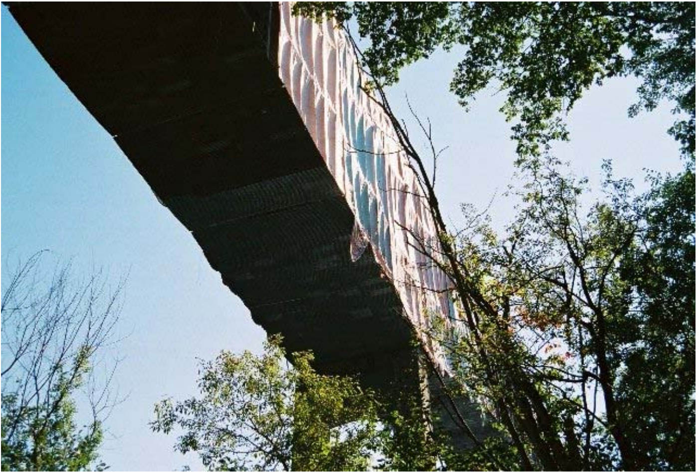
Cable Supported Metal Deck Platform System & Containment