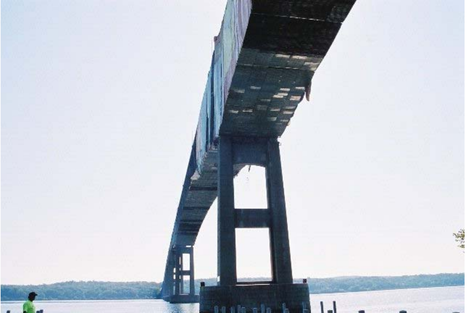
Platform & Containment

PROJECT DESCRIPTION: Steel Repairs & Blasting & Painting Project